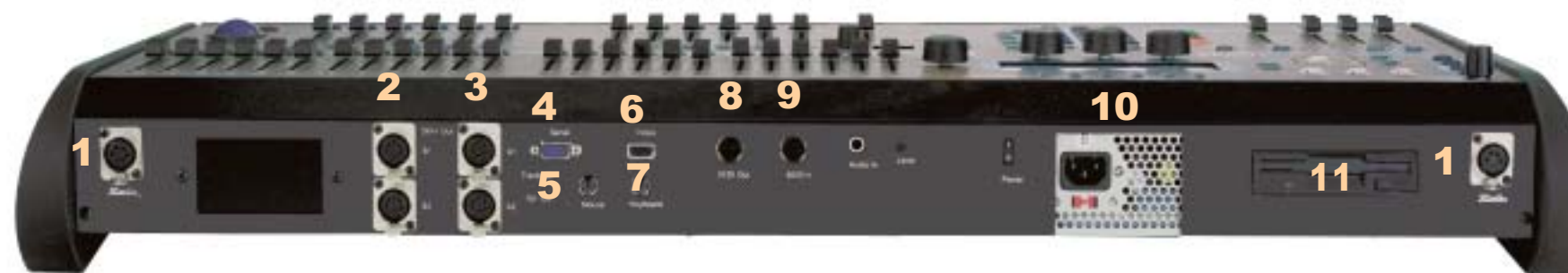
Back View of the LP-X